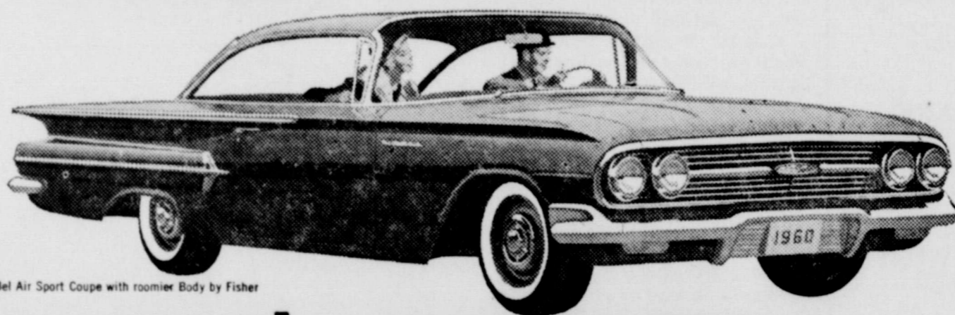
Bel Air Sport Coupe with roomier Body by Fisher

This year, more people are buying Chevrolets (including Corvairs) than ever before, making Chevy the year's hottest seller by a record-shattering margin. Come in and see what the buying's all about—at your Chevrolet dealer's soon!