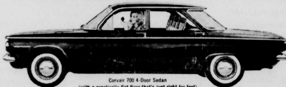
Corvair 700 4-Door Sedan (with a practically flat floor that's just right for feet)

See Chevrolet Cars, Chevy's Corvair and Corvette at Your Local Authorized Chevrolet Dealer's