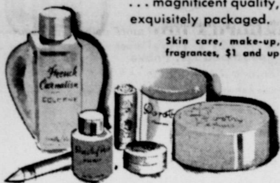
Skin care, make-up, fragrances, $1 and up

Accent your beauty with Dorothy Perkins cosmetics planned for you by the world's foremost beauty experts . . . exciting cosmetics to impart a fresh, youthful loveliness enchanting as the rose for which they were named. See our Dorothy Perkins beauty preparations . . . magnificent quality, exquisitely packaged.