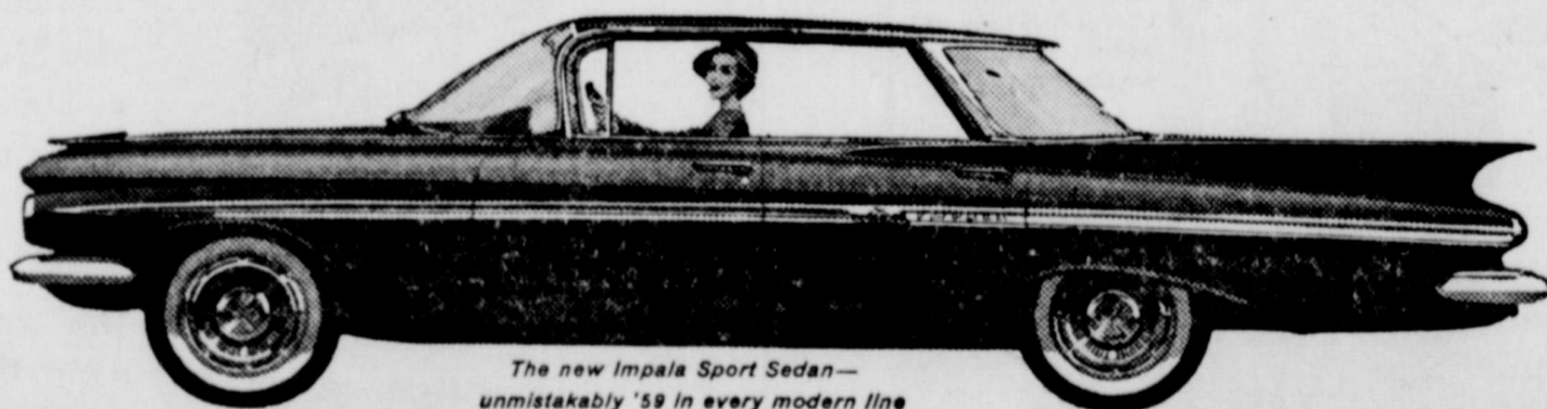
The new Impala Sport Sedan—unmistakably '59 in every modern line

A few cars cost a little less, most cost a lot more . . . but you'll find nothing else gives your dollars their due like this new Chevrolet. Never before has a visit to your Chevrolet dealer's been so worth your while!