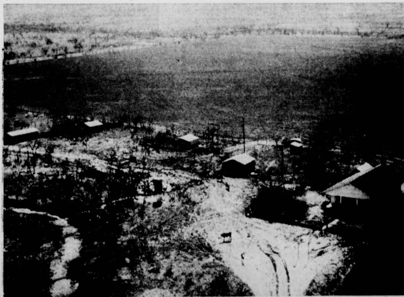
Who Lives Here?