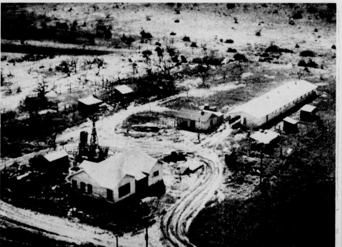
Who Lives Here?