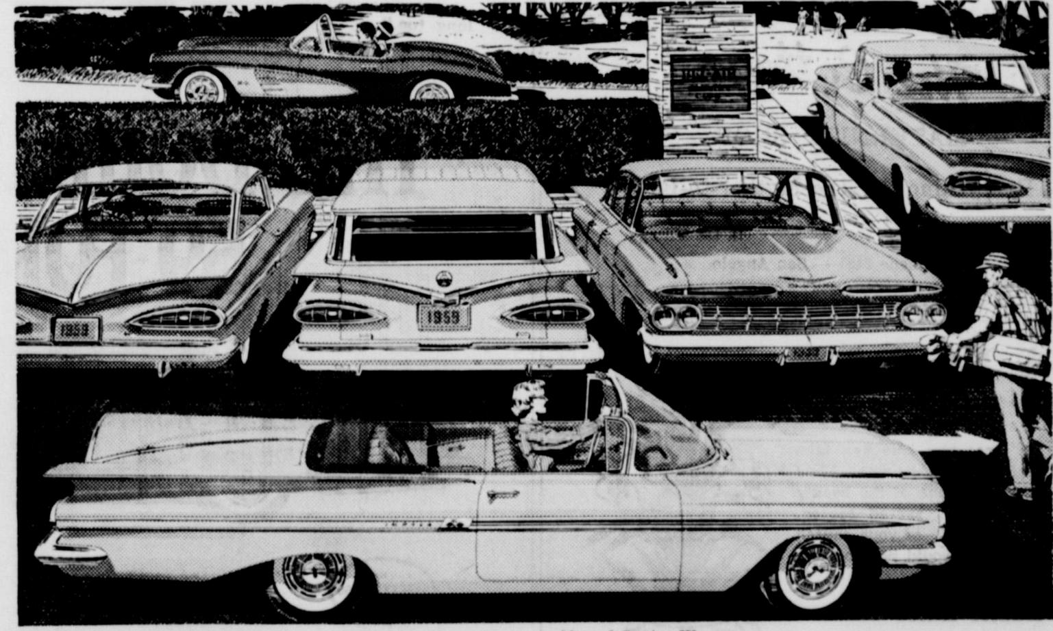
Your Chevrolet choice includes the Corvette, the Impala Sport Coupe, the Nomad Station Wagon, the Bel Air 4-Door Sedan, El Camino, and the Impala Convertible—all shown above.

now-see the wider selection of models at your local authorized Chevrolet dealer's!