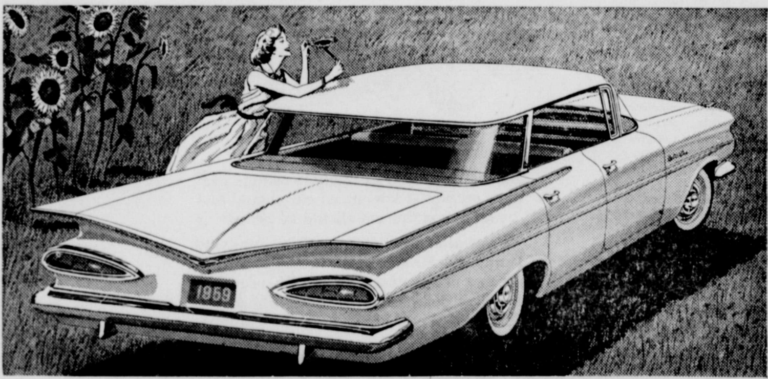
A new addition to Chevy's line-the beautiful Bel Air 4-Door Sport Sedan.

now—see the wider selection of models at your local authorized Chevrolet dealer's!