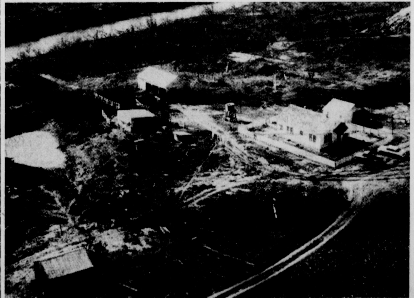
Who Lives Here?