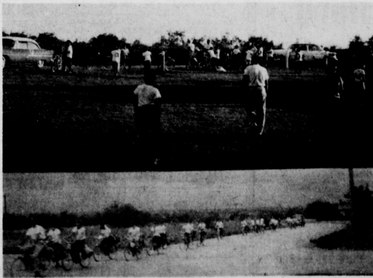
SETTING UP FOR THE NIGHT AND LEAVING—Twenty-five Boy Scouts and their leaders are shown above as they are parking their bicycles and getting set to spend the night in the County Park at Bronte. Lower shot shows the boys as they were leaving Bronte Tuesday morning. They were the guests of Bronte Lions Club and four local churches for supper Monday night and breakfast Tuesday morning.

Boys who successfully complete the journey will be awarded a merit badge in cycling.