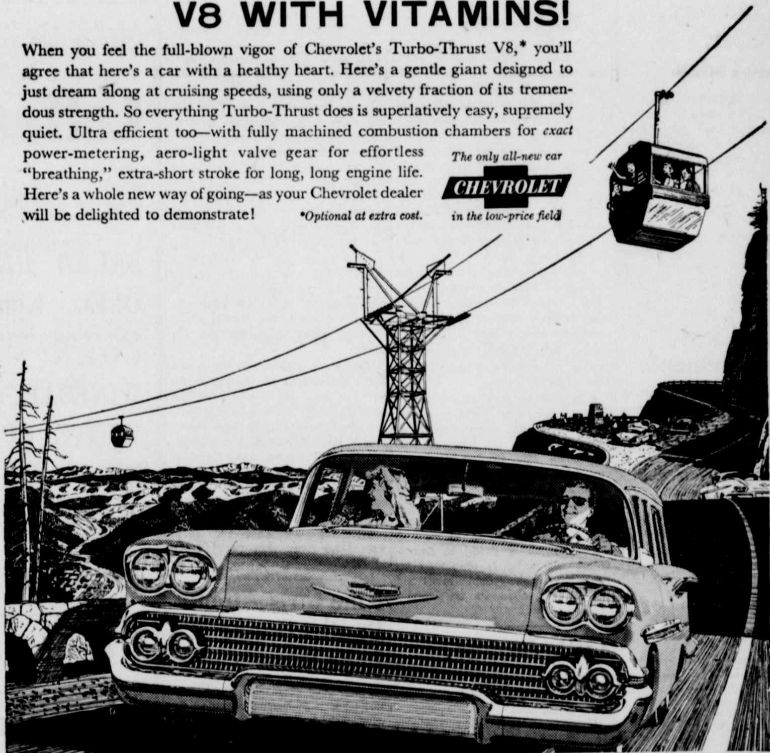
Air Conditioning—temperatures made to order. Get a demonstration! • The Brookwood Station Wagon. Every window of every Chevrolet is Safety Plate Glass.

The only all-new car CHEVROLET in the low-price field