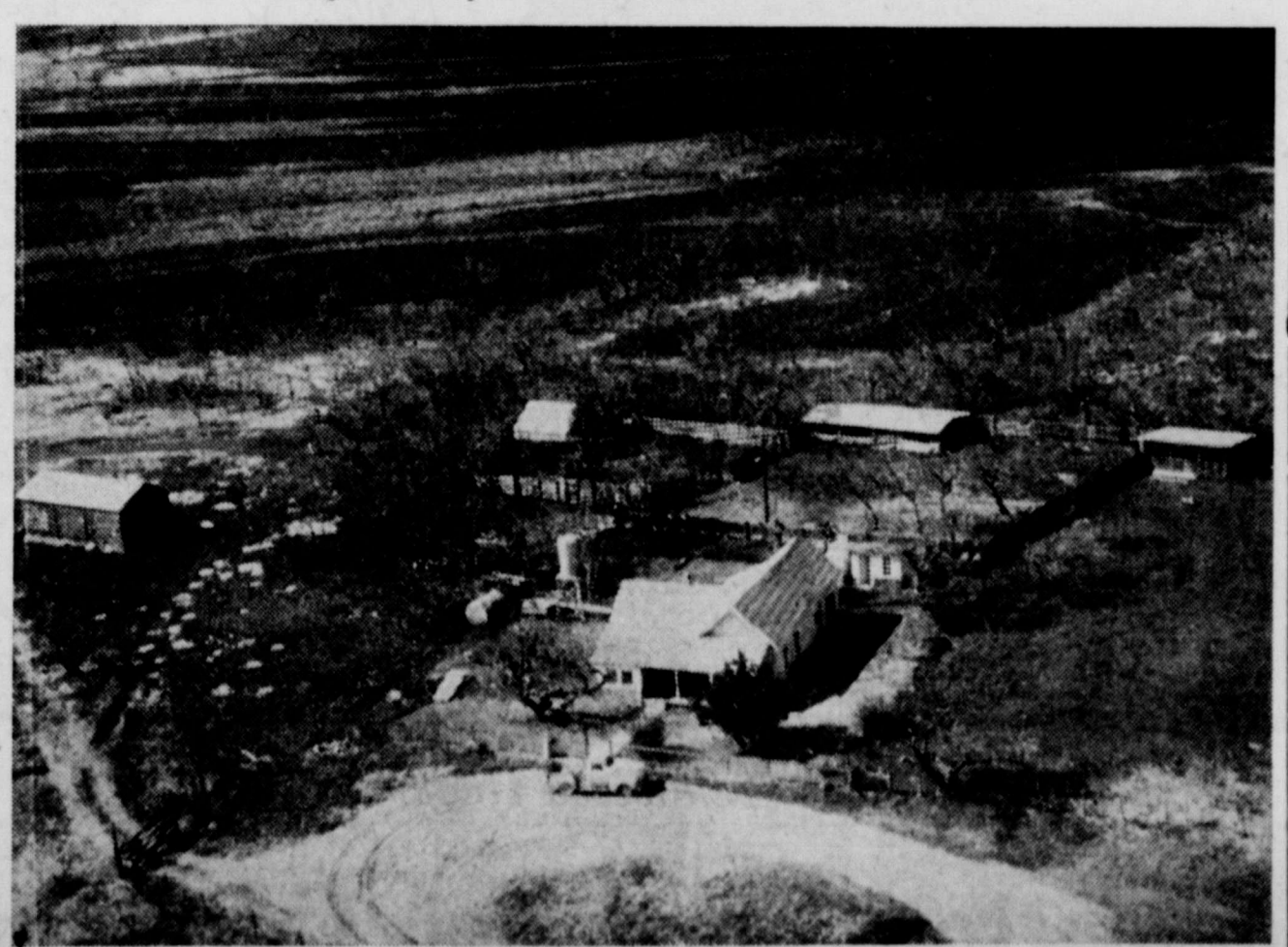
Who Lives Here?