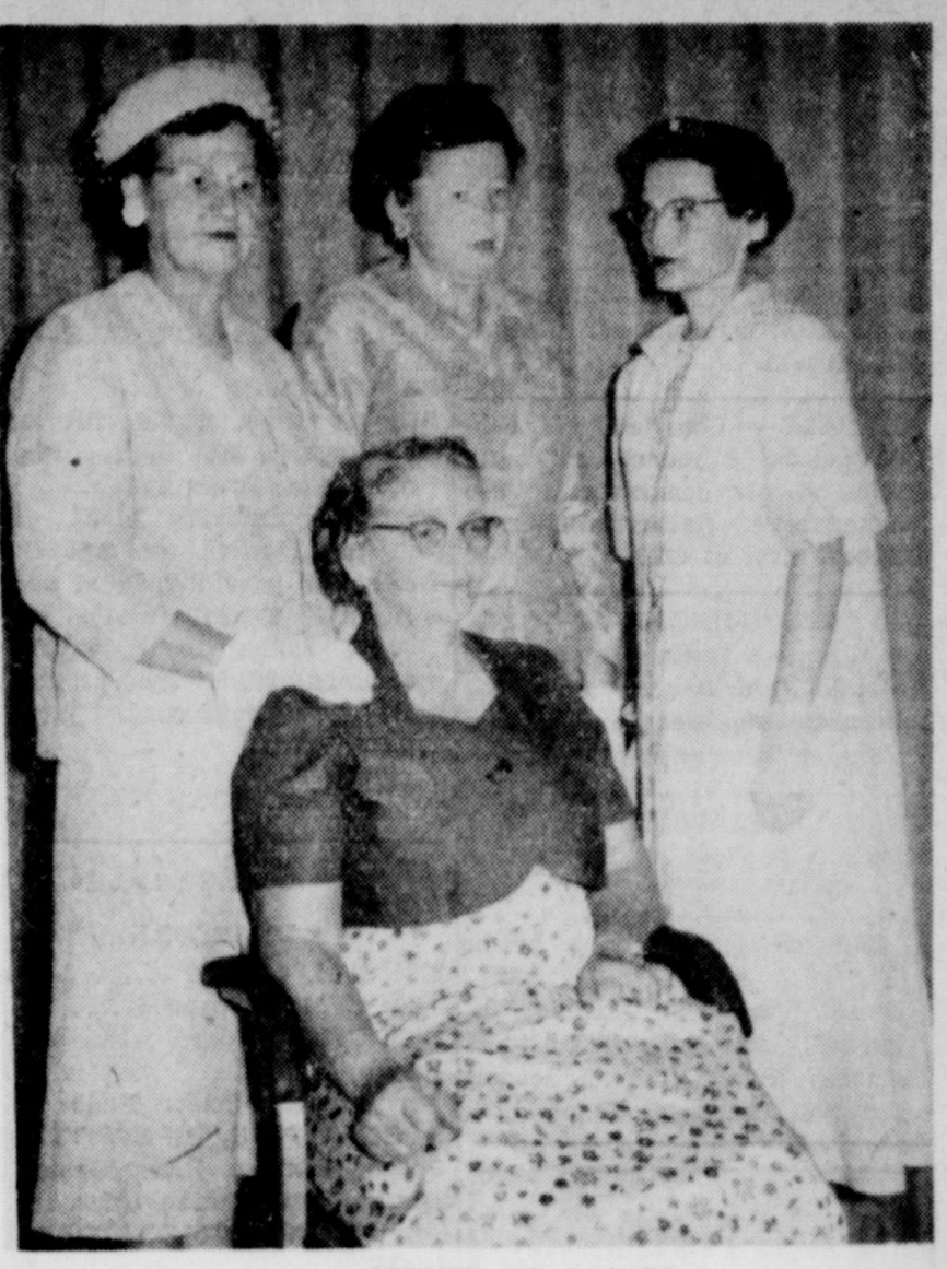
COUNTY HD LADIES ... model dresses they have made