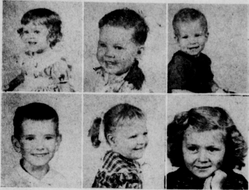
CITIZENS OF TOMORROW —Bronte youngsters who were photographed last fall will be featured in this newspaper for several weeks to come, until all the photos are run.