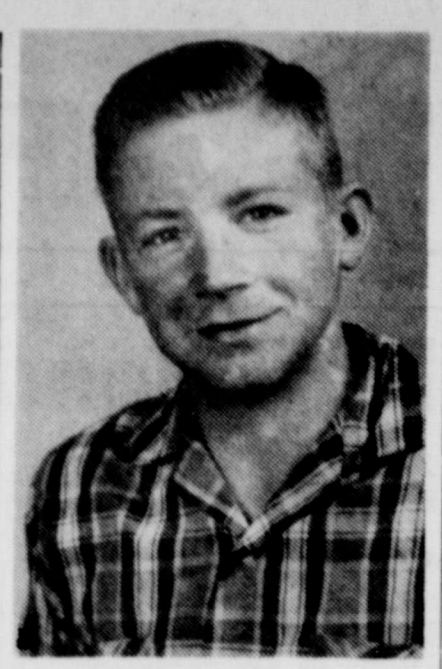
Meat Animal Award