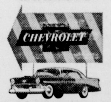
21/2 Million Cars!

AIR CONDITIONING—TEMPERATURES MADE TO ORDER—AT NEW LOW COST. LET US DEMONSTRATE.