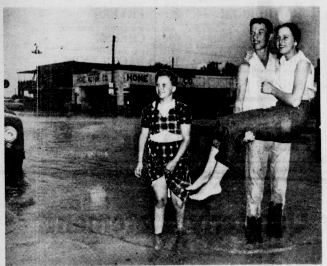
WATER BOUND-Water in Bronte had receded somewhat when the picture above was

morning. Note the line on the the high water was loss of approximately $1.500 worth of merchandise to the drug store.