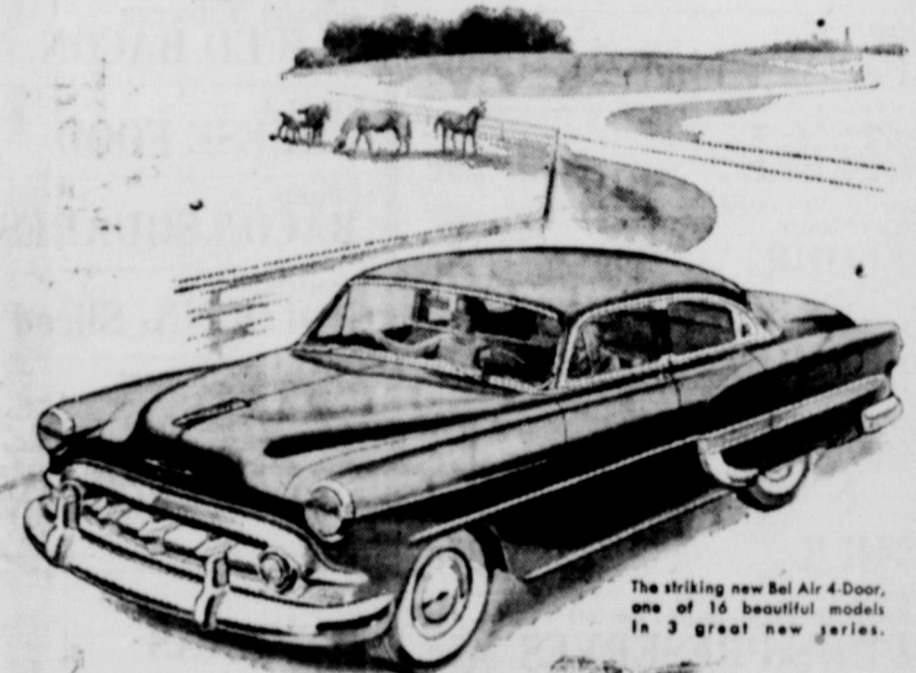
The striking new Bel Air 4-Door, one of 16 beautiful models in 3 great new series.