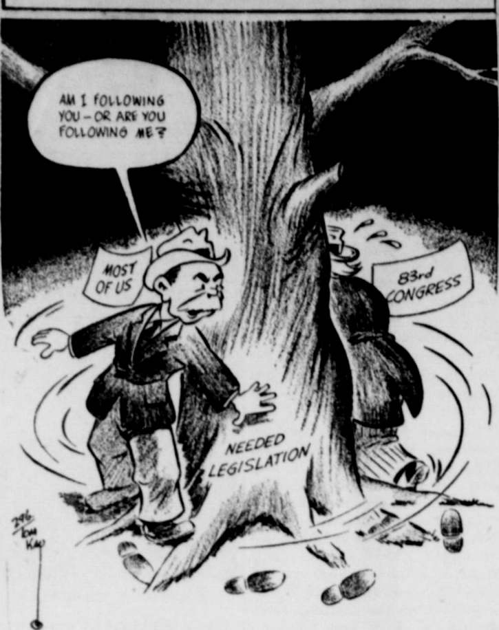
Get Together, Boys!

and ALL. We hope you see the humor in this column written by the sniffing pup.