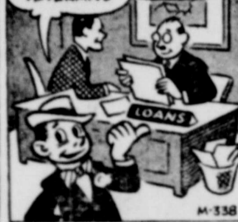
For full information contact your nearest VETERANS ADMINISTRATION office

VETERANS WHO SERVED ANYWHERE IN THE WORLD SINCE THE KOREAN CONFLICT STARTED NOW ARE ELIGIBLE FOR GI LOANS ON THE SAME BASIS AS WORLD WAR II VETERANS