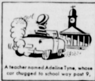
A teacher named Adeline Tyne, whose car chugged to school way past 9.