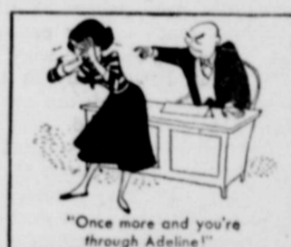
"Once more and you're through Adeline!"

Then I got Conoco's NEW I-2-3 "50,000 Miles No Wear" Service!