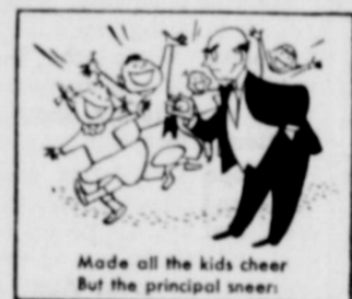
Made all the kids cheer But the principal sneer.