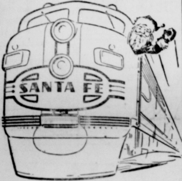
Let your Santa Fe Agent arrange your holiday trip.

Santa Fe is the family way to travel. Children under 5 years ride free, under 12 for half fare, when accompanied by an adult. Take along your Christmas bundles, too; 150 lbs. of baggage allowed free with each adult ticket.