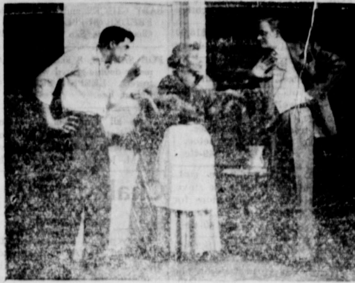
BOX & COX