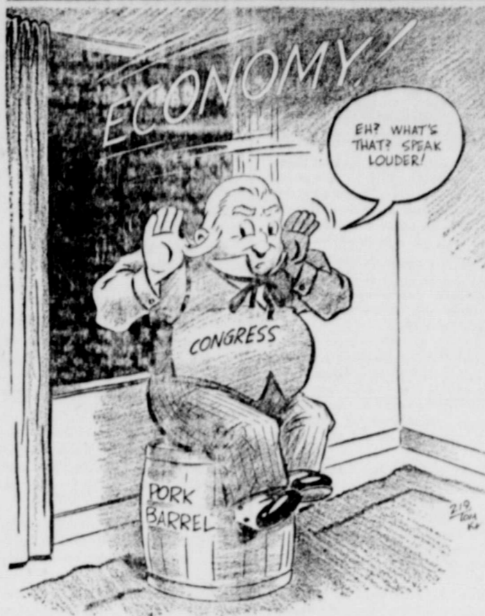
A Hearing Aid Would Help