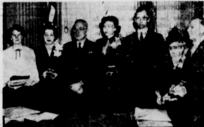
MEDAL OF HONOR GIVEN—