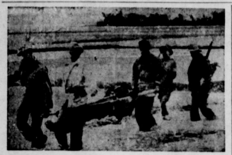
FRENCH WAGE WET WAR

Indo-China - Due to many rivers and lakes in the Indo-China delta, most of the French military opera- through heavy marshland.