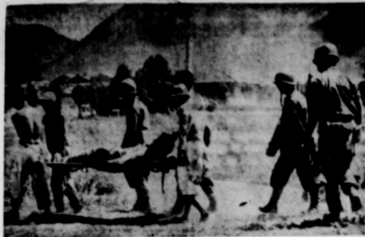
KOREANS AID MARINE SOUTH KOREAN BATTLE-FRONT — A wounded marine is shown being carried back from the front by weary South Korean

stretcher-bearers and a U.S. marine corpsman. Just one of the casualties suffered during the 2nd division's drive toward the Nakdong River.