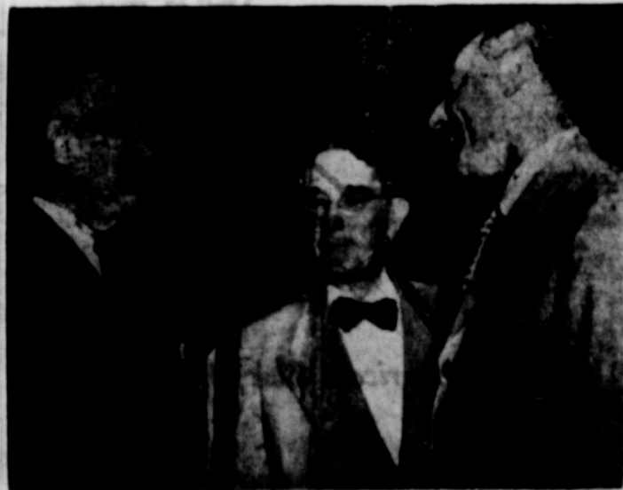
DISCUSS EXPENSES— WASHINGTON—Shown above, left to right, are former Secretary of Defense Louis Johnson, Chairman Kenneth McKeller (D), Tenn., of the Senate appropriations com-