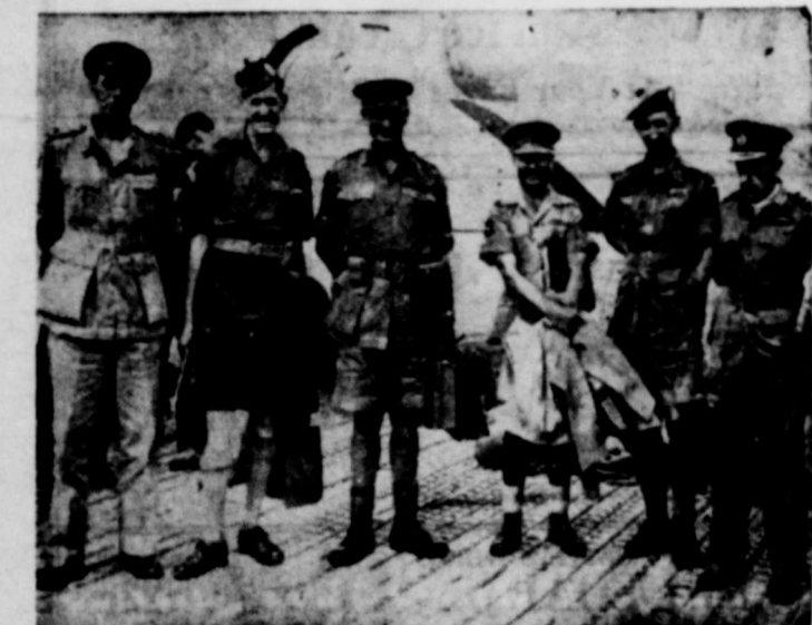
BRITISH ARRIVE— PUSAN, KOREA—British officers are shown posed beside a U. S. air force plane upon their arrival at Pusan airstrip. They were the first troops to reach here by air from Hong Kong—part of the British forces sent to aid UN war against North Korean Reds.

mittee, and Secretary of State Dean Acheson conferring at the Capitol as administration leaders met with the committee in executive session to consider the 16.7 billion dollar military appropriations bill.