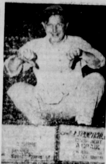
BAN RUSS GOODS