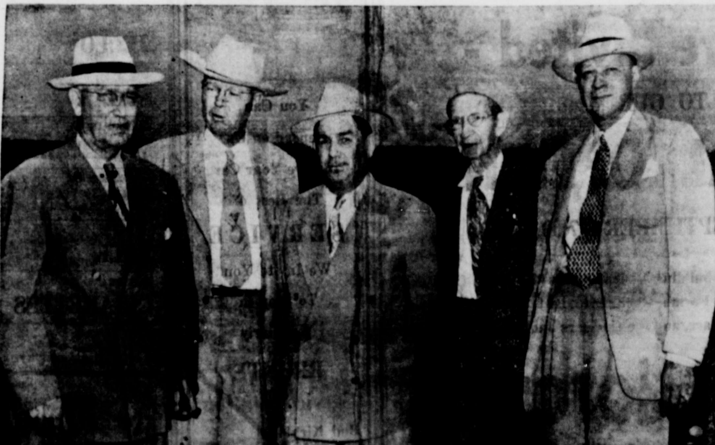
TAKE PART IN CEREMONY—