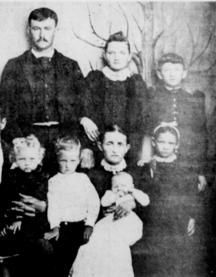
DO YOU REMEMBER?