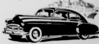
Drive home this fact... FIRST... and Finest... for DRIVING AND RIDING EASE AT LOWEST COST

Come in... drive home the facts of Chevrolet's greater all-round performance with economy... and you'll decide to drive home in a new Chevrolet!