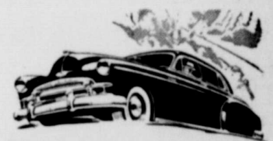
Drive home this fact... FIRST... and Finest... for STYLING AND COMFORT AT LOWEST COST