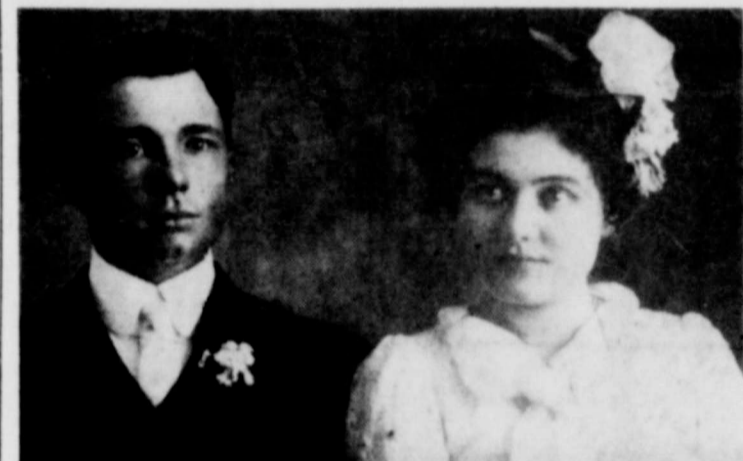
48 YEARS TOGETHER—