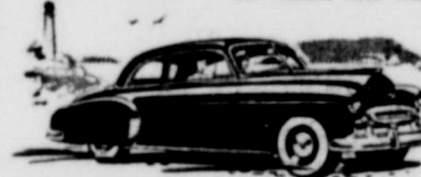
Drive home this fact... FIRST... and Finest for ALL-ROUND SAFETY AT LOWEST COST