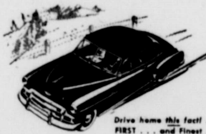
Drive home this fact... FIRST... and Finest... for THRILLS AND THRIF!

Chevrolet is FIRST... and Finest... at Lowest Cost!