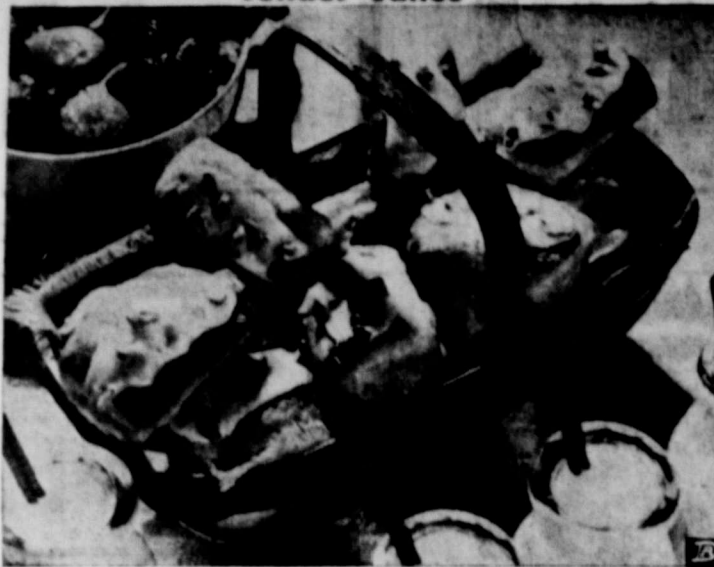
Bring delightful eating and good nutrition to your table with a basketful of tender Janes, tiny leaf-shaped sweet rolls.

Tender Janes are another of the excellent puffs and sweet rolls you can make from a beaten batter which requires no kneading. The main ingredient in the batter is enriched flour, which makes these rolls a good source of essential B-vitamins and iron.