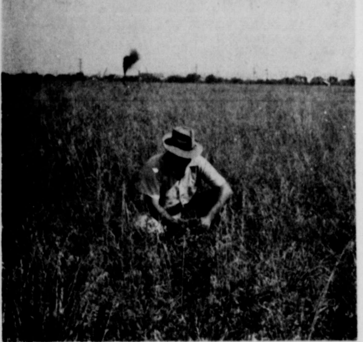
A. V. Sheppard, work unit conservationist, with the Soil Conservation service, observing growth of Madrid sweet clover seeded on and one-half tons of hay per acre

Bronte. The clover was cut and baled for hay and produced one