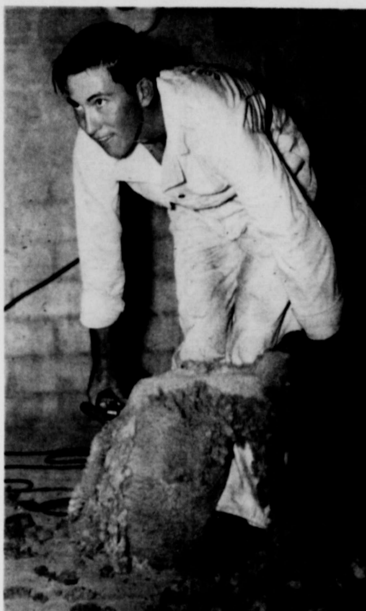
DOES IT AGAIN