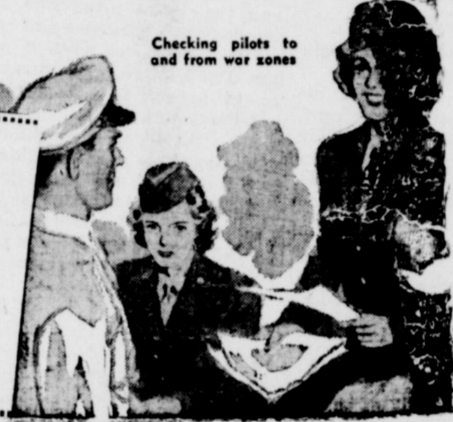
Checking pilots to and from war zones

SINCE 1900 Minter's LEADERS IN STYLE! ABILENE, TEXAS