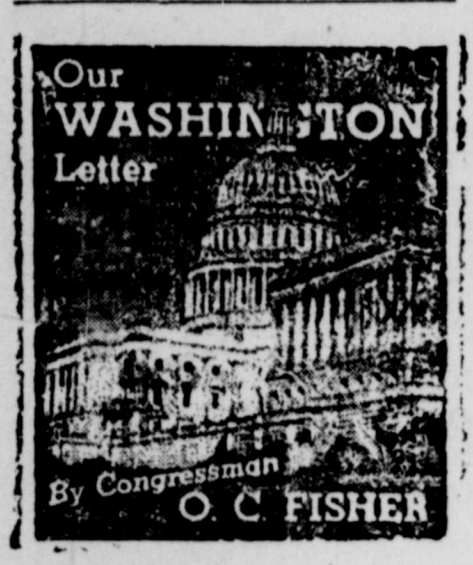
House Votes Funds for Navy-

More trouble for the Japs was foreshadowed last week when the House voted a requested billion an a half dollars to be used to build and operate bases in the combat zones. It was indicated much of this will be spent in the Pacific.