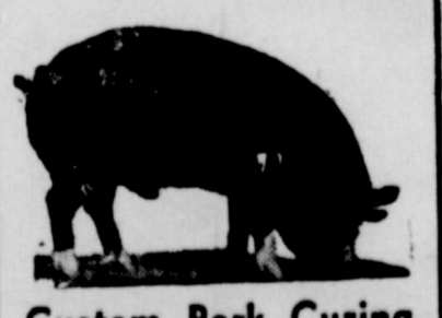
Custom Pork Curing

Order your fall chicks NOW! . Our hatches come off each . Tuesday. Finest quality chicks from pullorium tested flocks BOX NUTT & WILLIAMS, 664, Ballinger, Texas. 44-tf