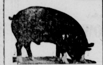
Custom Pork Curing

We cut up your hog, grind and season sausage, render lard, cure and hickory smoke the meat.