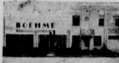
Our New Plant, Built in 1941

West Texas' Most Popular Loaf For Over 30 Years!