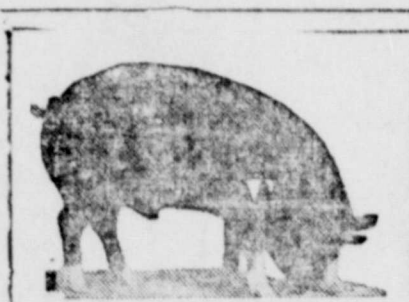
Custom Pork Curing

We cut up your hog, grind and season sausage, render lard, cure and hickory smoke the meat.