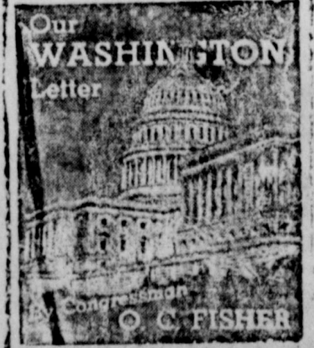
Pretty Fair Record-