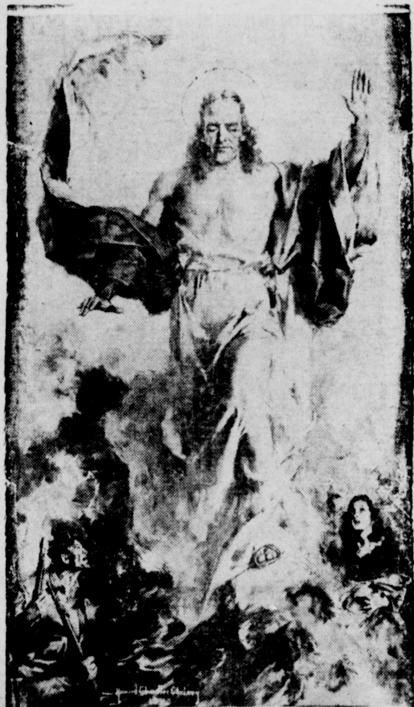
"THE COMING PEACE AND THE PRINCE OF PEACE" Painted by Howard Chandler Christy as an artistic symbol for the Crusade for a New World Order of The Methodist Church, this picture will soon be displayed as a poster in color in all the churches of the denomination. Post card reproductions will be mailed to service men all over the world.