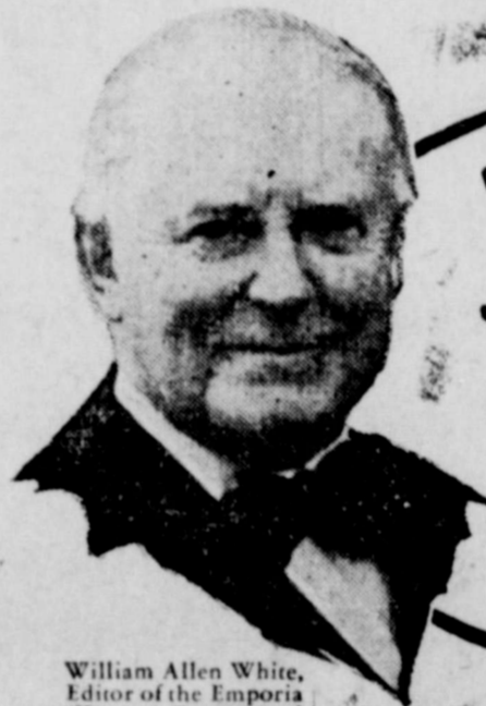
William Allen White, Editor of the Emporia (Kansas) Gazette, and celebrated American journalist and author.