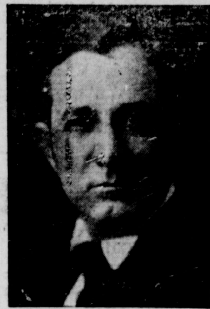
SENATOR TOM CONNALLY

Dallas, October 15—Chairman Tom Connally of the Senate Foreign relations committee flatly asserted Sunday that the United States will seize and hold French colonies in the Western Hemisphere by force if Vichy permits their use by Germans. The Marlin Senator addressed a rousing color-splashed Defense Day rally Sunday in the Cotton Bowl.