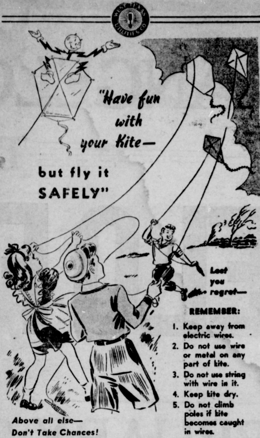
Above all else— Don't Take Chances!