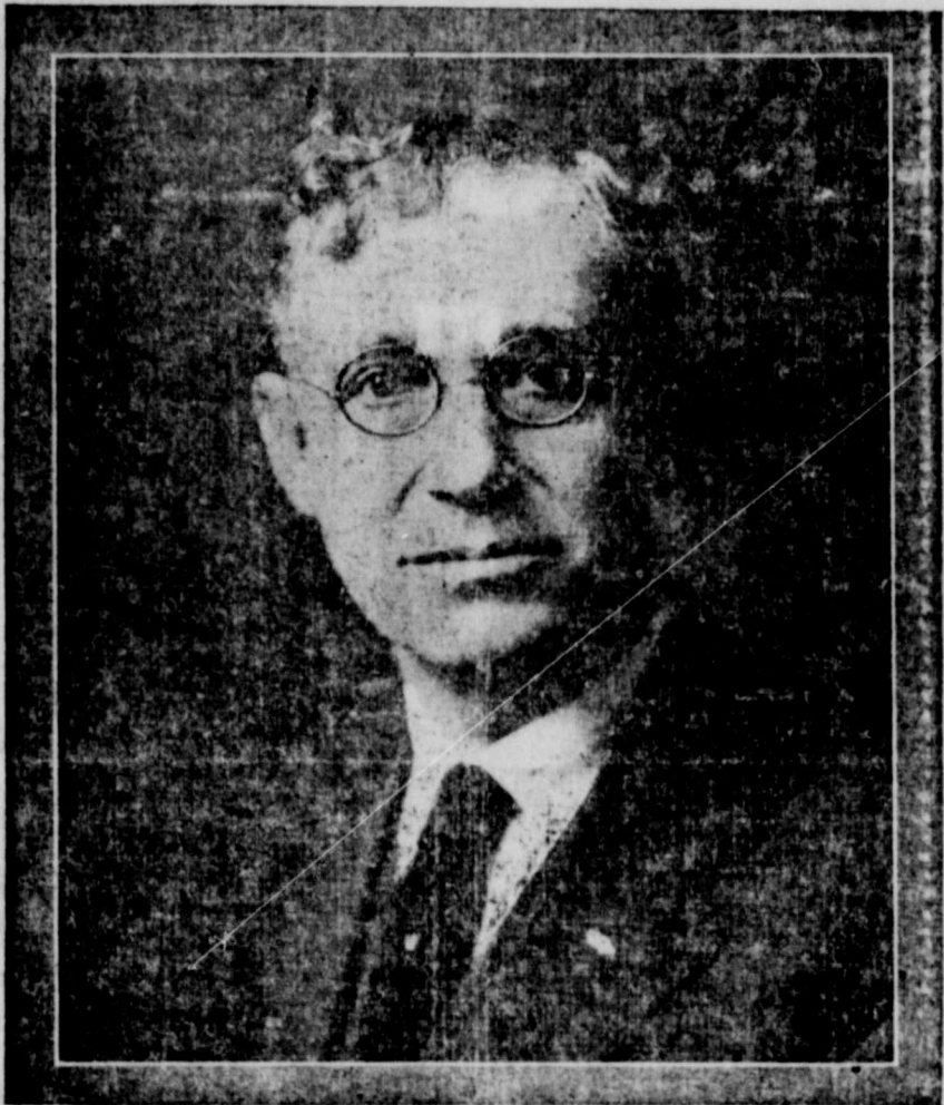
President of Hardin-Simmons University, at Abilene, who died Friday evening, March 22, 1940.