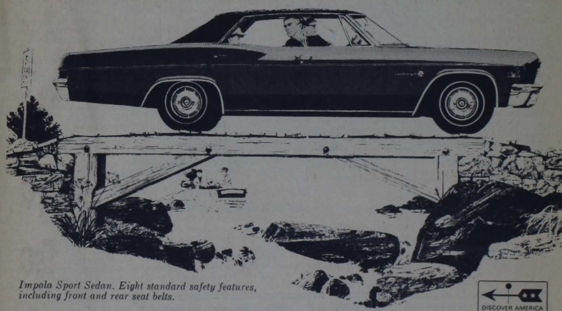
Impala Sport Sedan. Eight standard safety features, including front and rear seat belts.

CHEVROLET'S ALWAYS BEEN FAMOUS FOR SMOOTHING OUT ROUGH ROADS And right now for a Double Dividend, you get a buy that'll smooth out your budget!