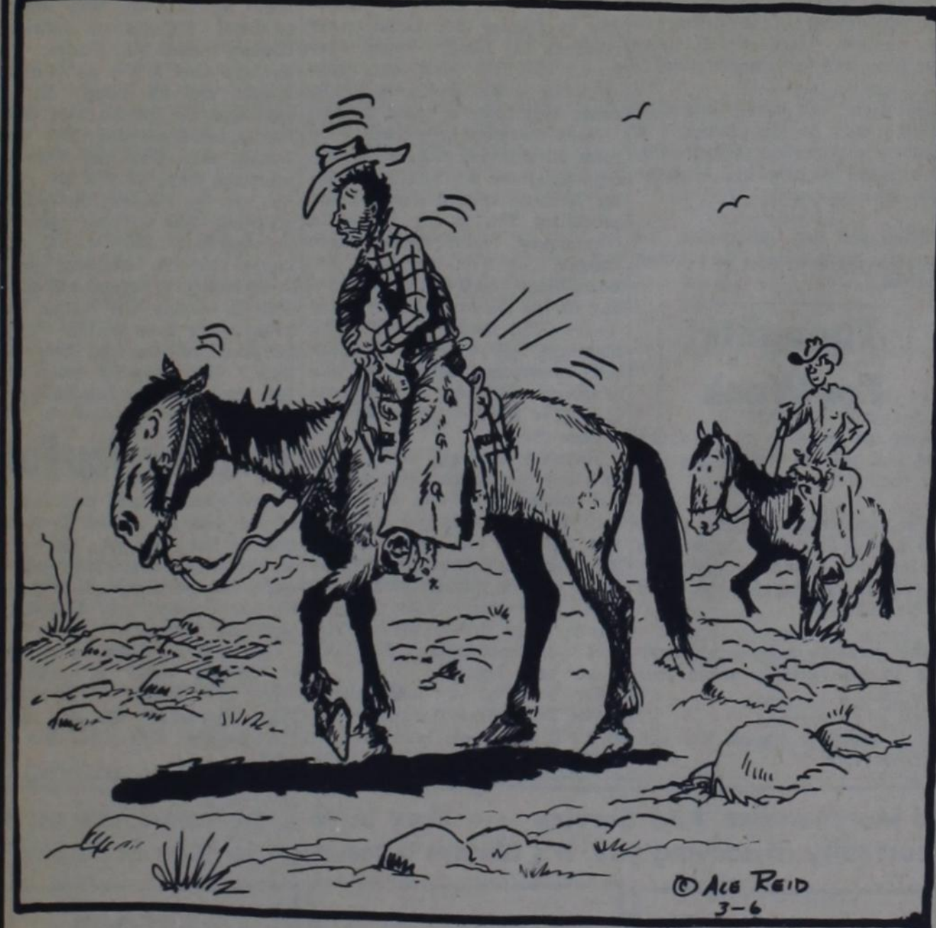
"This dang hoss jist has two gaits—severe jar and plain spine buster!"