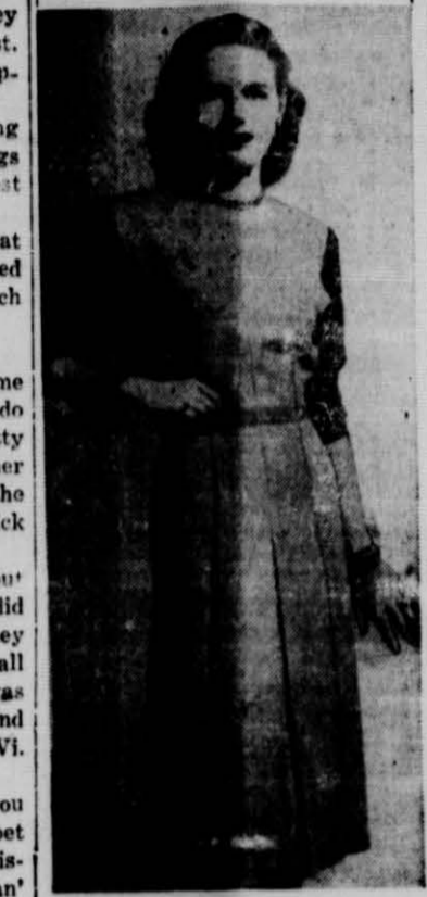
Smart, thrifty girls, anxious to be well dressed, make tailored dresses like this and save dollars for Victory Bonds. This has gray spun rayon with deep red stripes, royal blue. Patterns at local stores.