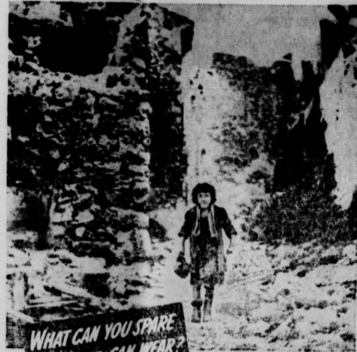
WHAT CAN YOU SPARE THAT SHE CAN WEAR?

This little girl is free—to fend for herself! Free—to face a multitude of problems. Her problems are the world's problems. Let's face them. For instance, let's face the desperate need for clothing by the victims of Nazi and Japanese oppression. Dig into your attics, trunks, and closets today... dig out all the clothing you can spare.