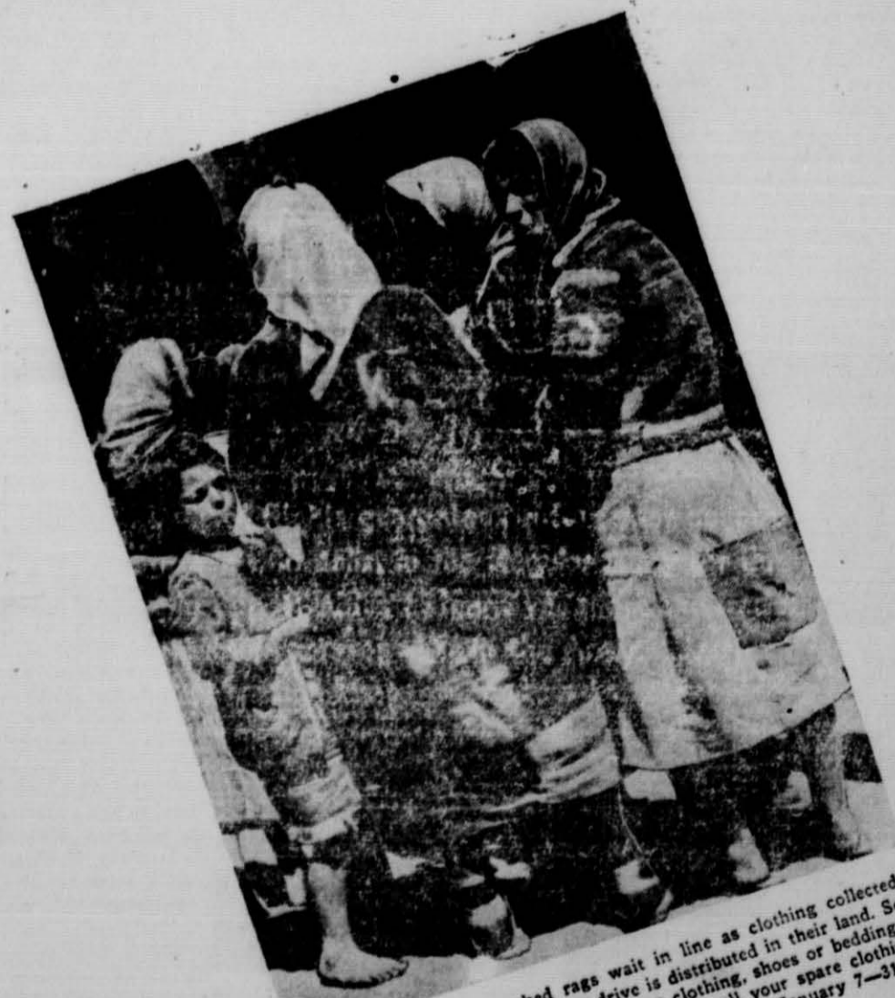
GREEK women in patched rags wait in line as clothing collected in America's nationwide appeal drive is distributed in their land. Seven million other bombed-out Greeks with no clothing, shoes or bedding face the bitter winter living in frail huts. Give all your spare clothing to the Victory Clothing Collection for overseas relief, January 7-23.