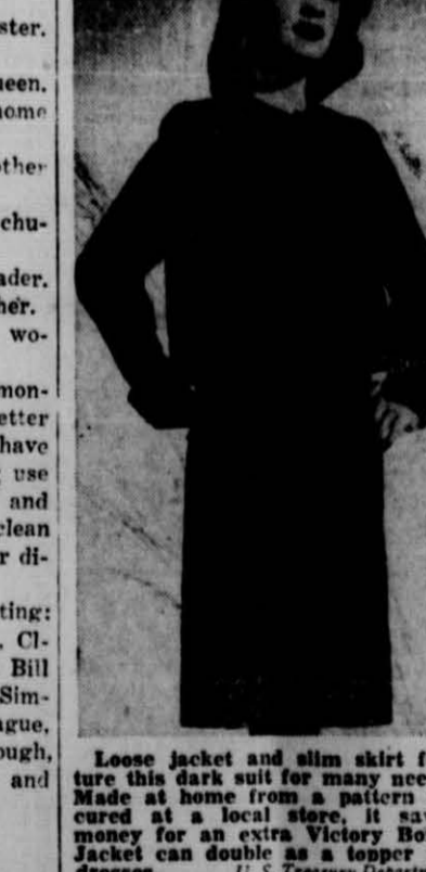
Loose jacket and slim skirt feature this dark suit for many needs. Made at home from a pattern secured at a local store, it saves money for an extra Victory Bond. Jacket can double as a topper for dresses. U.S. Treasury Department