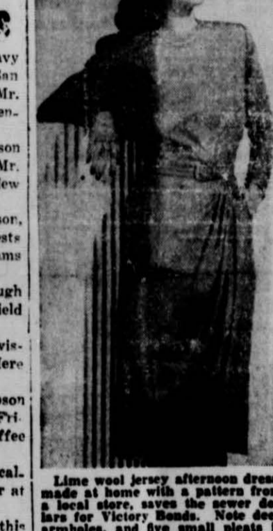
Light wool jersey afternoon dress, made at home with a pattern from a local store, saves the good dollars for Victory Bonds. Role deep armholes, and two small pleats in draped skirt. U.S. Treasury Department