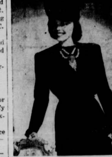
Every woman needs a basic black crepe dress. She can make this one at home at a saving for a Victory Bond. The top is bloused and gathered in smooth yokes over the bustline. A simple crepe skirt is slightly fuller than recent wartime models. Patterns at local stores.