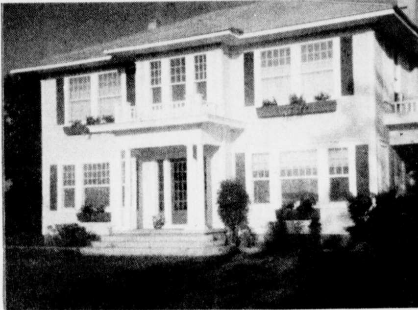
Front of house, June 1989

roof which was in excellent condition. They only change was to make the lower floor two rooms, kitchen and breakfast room were made into one room as a kitchen-dining area. They had carpenters working inside three months, tearing out walls and rebuilding. By the time it was finished, Johnny Waldrop and Howard Reid had a personal interest in all that went on. Joe Kozelsky built the cabinets which are white with blue pulls and blue vinyl tops. The drawers have double depth for storing although they look like single drawers from the outside. The wall paper is blue with tiny white and mauve colored flowers. Wanda made the shades of mauve fabric with tiny blue flowers. These are necessary to keep out the hot morning sun. When raised the shades fold into pleats, a valance also lends a pleasing effect. The windows are flanked by open shelves that hold some of Wanda's many fabric dolls which she creates as a hobby and for her grand-