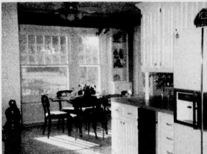
Looking from kitchen area through dining room. The three large windows give excellent view of front lawn

tubes of calking compound was used to seal every door, board and window. The house was then painted a soft yellow trimmed in white. Shutters and window boxes were added for decoration and a harmonious effect. Nothing was done to the children. She also uses her wood carving hobby to make many of the decorations in the house. The hallway is papered with the same design used in the dining area. The foyer and living room are covered with mauve colored carpet. The living room