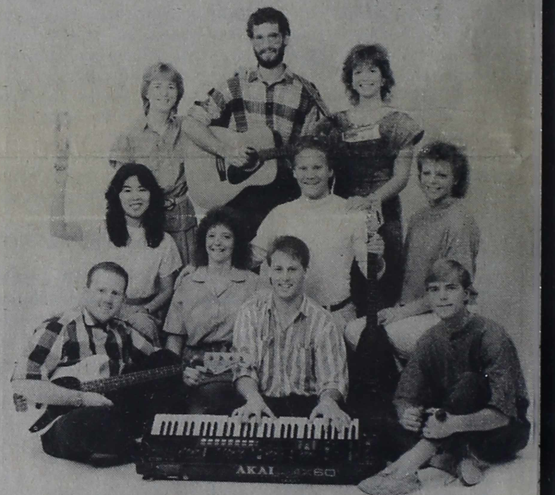
Members of the "Shaliach" Ministry charge and open to the public. All ages are invited for an evening of celebration and inspiration.