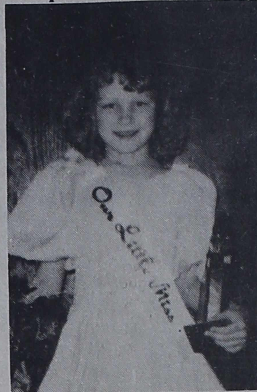
Our Little Miss

Tip of the Week: Fresh shrimp, cooked or uncooked, is easy to clean. After peeling, use a small pointed knife to cut the length of the outside curvature. Remove the black sand vein and wash the shrimp.