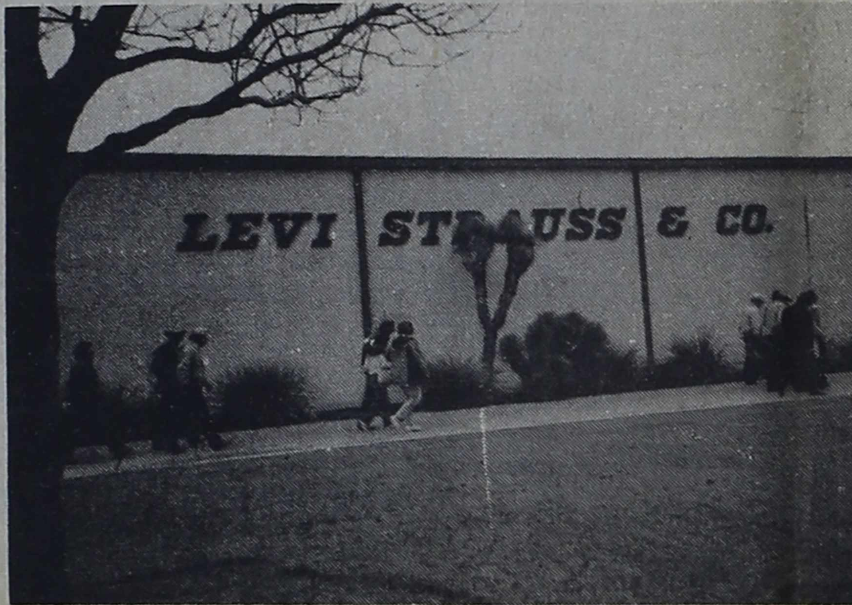
Levi Strauss Factory at San Angelo—makes 80,000 pairs of Levis a week

"We have quality check pants," said the production manager. Any article that doesn't meet specifications is thrown out and we start over.