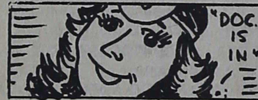
In 1849, Elizabeth Blackwell was the first American woman to become a doctor.