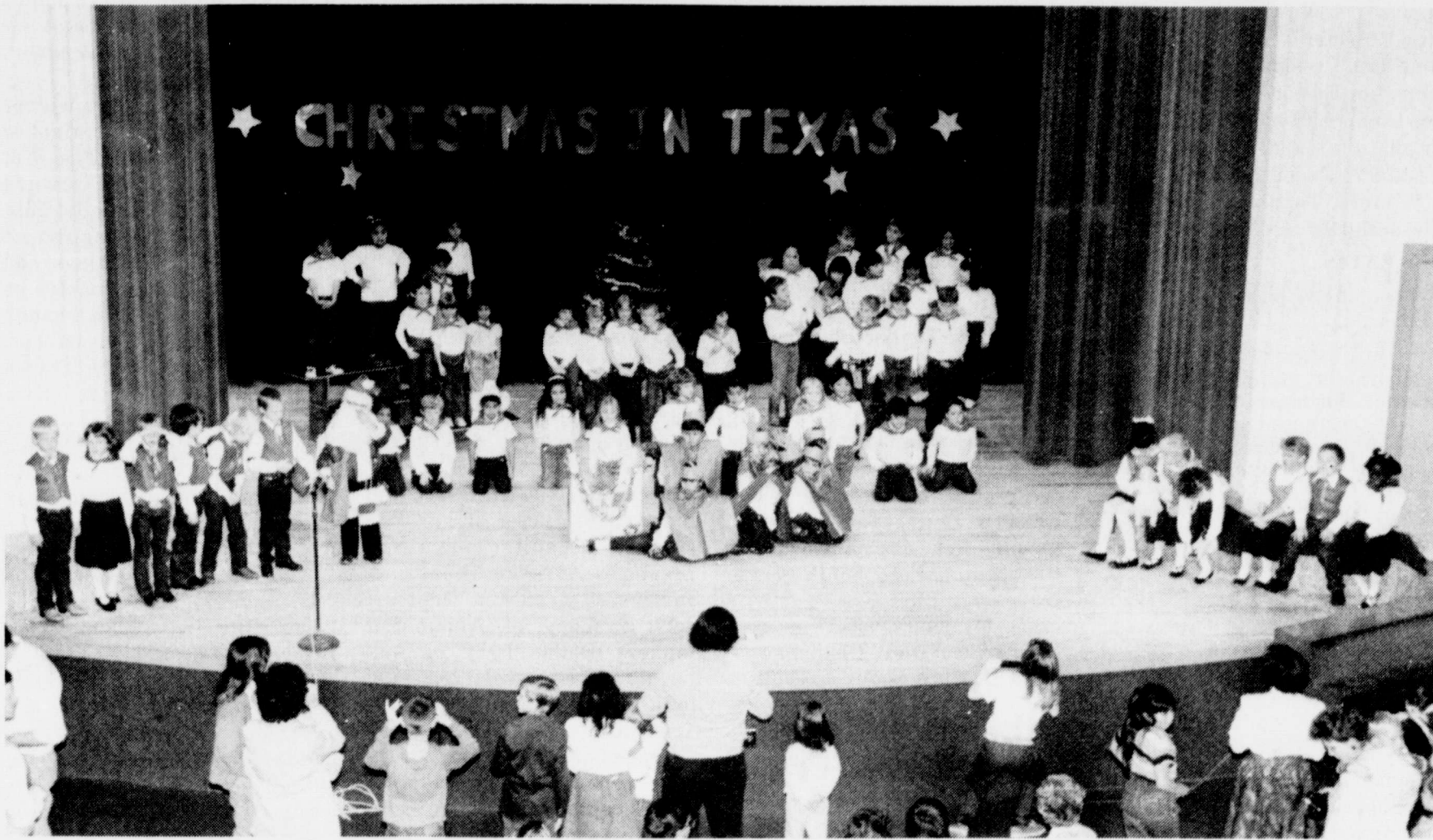
A Texas Christmas presented by the Winters First Grades