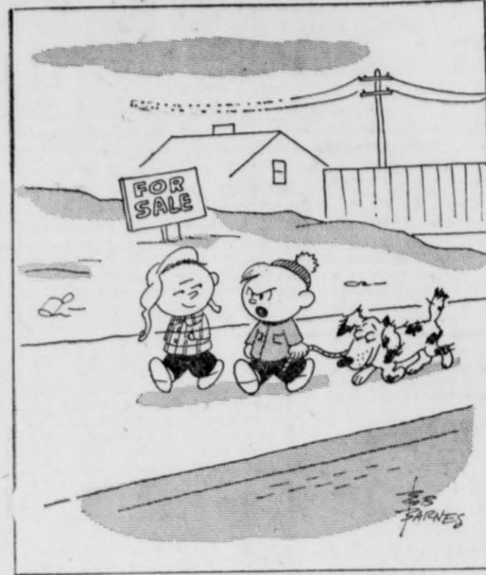
"I'm sorry I learned to read! . . . My dog's pedigree papers turned out to be an old electric bill!"