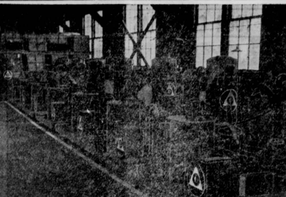
WATER FILTRATION units in the Federal Civil Defense Administration warehouse at Seneca, nuclear-blast-proof and built to withstand a possible future disaster. These units—brought from larger cities to lessen the chances of blast damage and fallout.