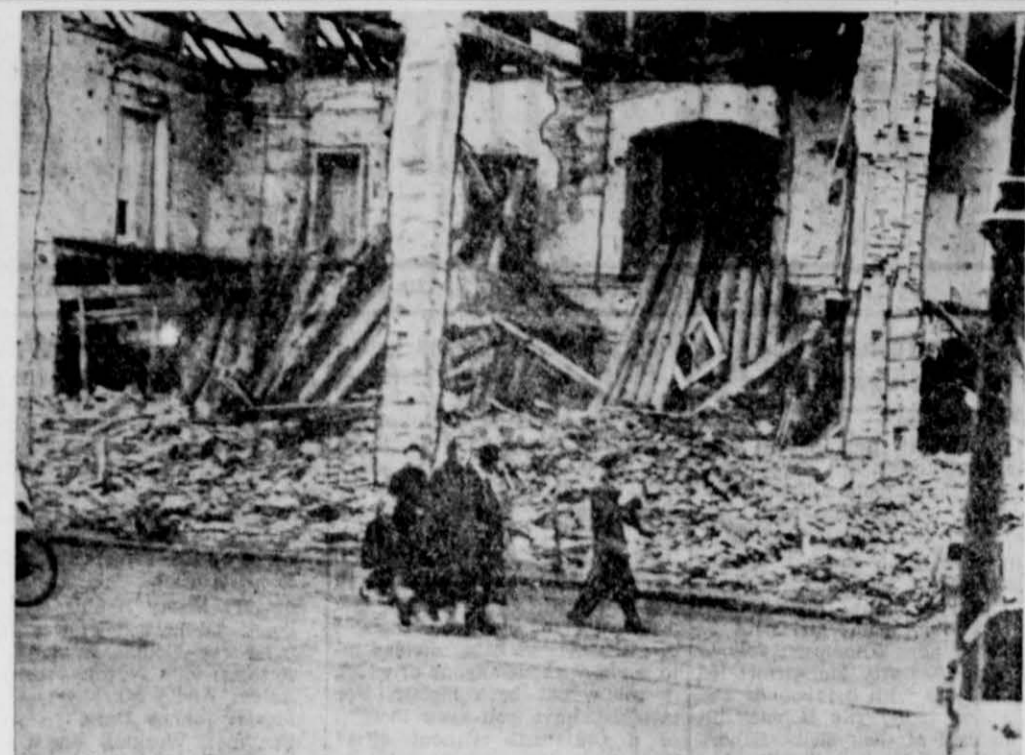
RED RUIN... Hungarians face task of rebuilding revolt-torn Budapest to provide winter shelter for hundreds and to enable industry to resume operation.