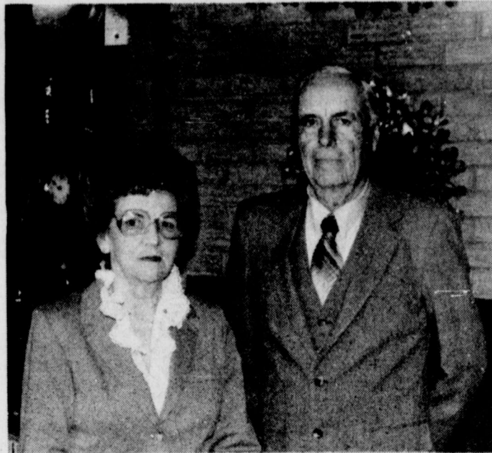
Celebrating Golden Anniversary...