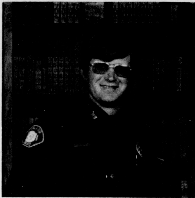
To attend FBI Academy...