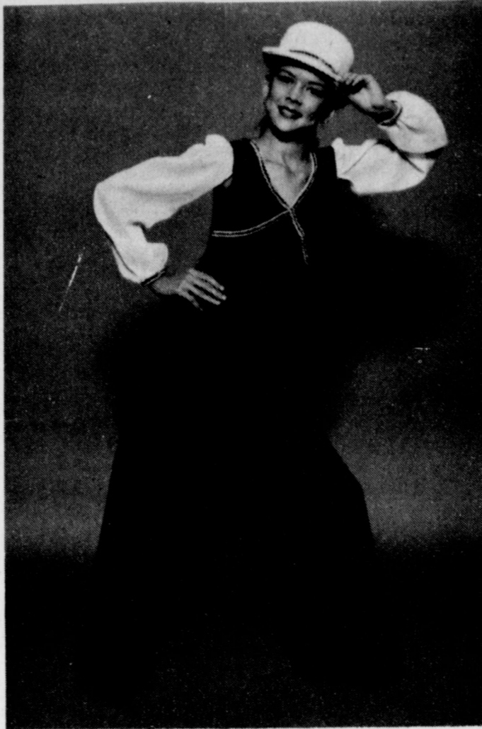
Performed jazz dance...