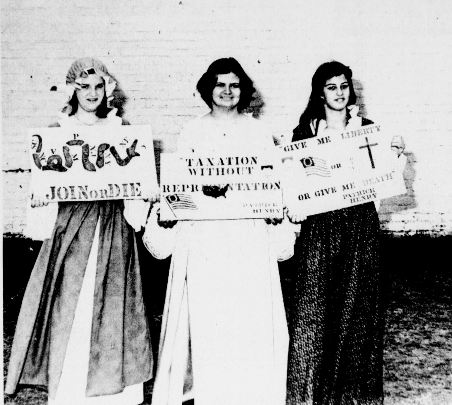
BICENTENNIAL —Dressed in Revolutionary period dresses, these three young ladies of Winters Junior High School start pre-show publicity for the Bicentennial Pageant to be