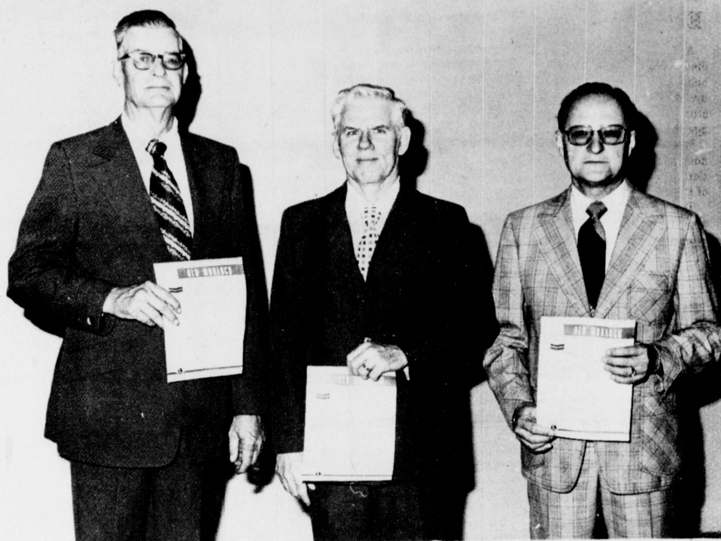
60 YEARS OF LIONISM—These three members of the Winters Lions Club have a total of 60 years in the club. They received certificates last Tuesday during the ladies night

FOR A FAVOR No. Would you favor a constitutional amendment or legislation banning the use of forced busing of school children for the purpose of achieving racial balance? AGAINST ENCONTRA ¿Apoyaria usted una enmienda constitucional o legislación que prohibiría el uso de transporte mandatorio de niños escolares con el propósito de lograr el equilibrio de las razas?