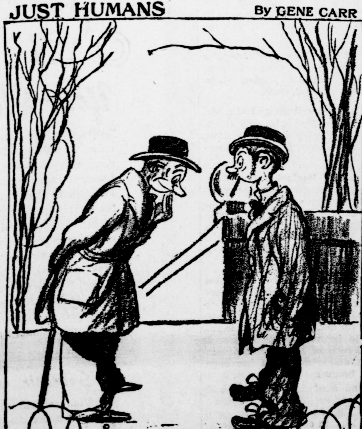
"What is That You Have on Ya Puppies?" "Spaghetti th' Wife Had a Failure With."

Pa told his boy he would do everything the boy did just like a young man but when the boy told dad he must go without his hat and roll down his socks to his shoe tops, Pa said nothing doing.