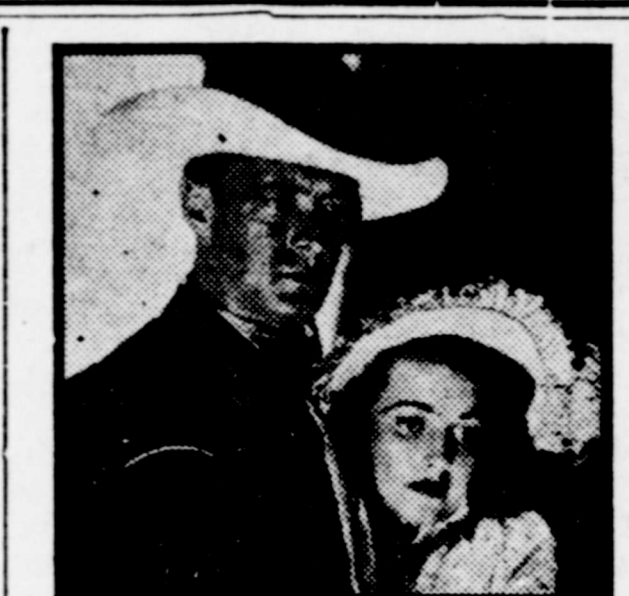
STIRRING STORY OF LAND RUSH TOLD IN 'ROLLING CARAVANS'

of our kinfolks was dead all the time. Ward.